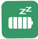
Long Standby Time